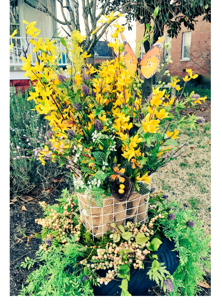
Spring has arrived at Bay Haven Inn of Cape Charles! Don't you want to arrive here too?

Copyright © 2016, Bay Haven Inn of Cape Charles. All rights reserved.